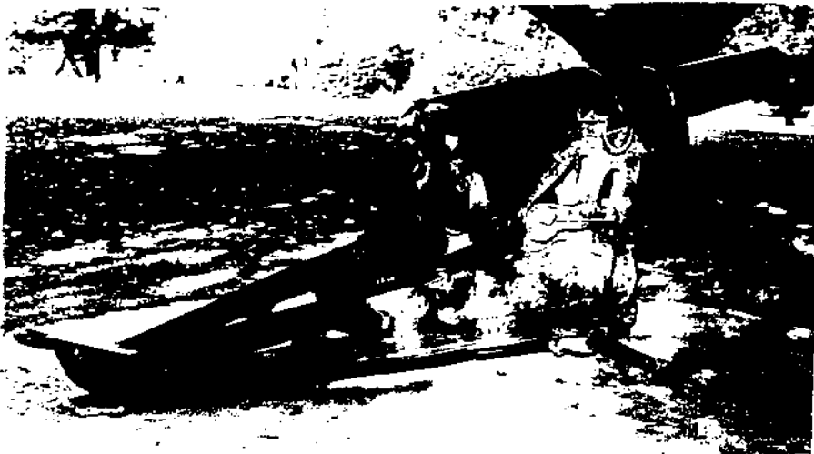
Fig. 103: RML 6.6-in gun on siege carriage. Wheels are missing.

Note extreme angle of elevation was only 30° even for howitzers.