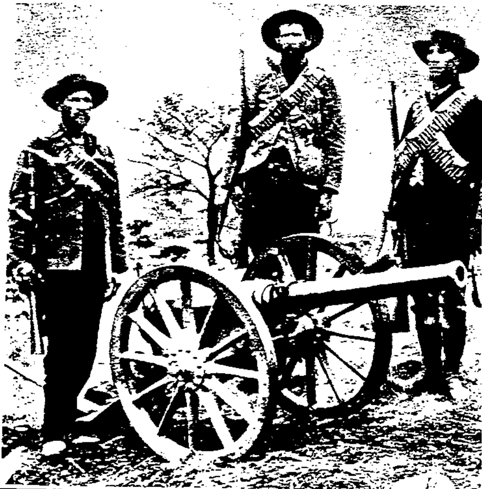
Fig. 113: The Screw Gun.

From the outside the Mark 2 looked identical.