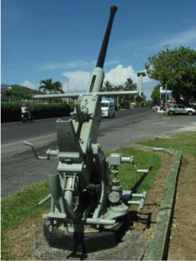
40 mm Bofers outside the RSA in Rarotonga