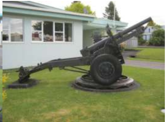
5.5 In Gun National Army Museum Waiuru