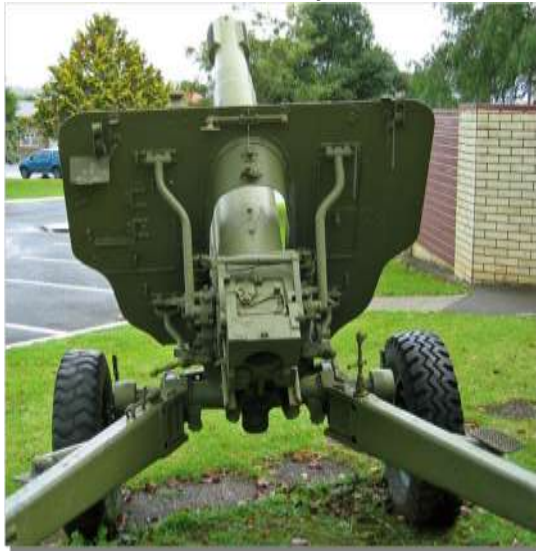
Taradale District RSA Inc. 1942 25 Pounder Field Gun - Howitzer MKII Gun fitted on a MKI Carriage which was the standard NZ Field Gun in WWII