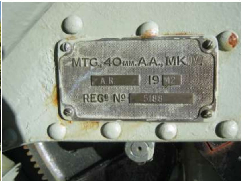
Ships Gunnade On the veranda of the Museum at Mokau, SH3