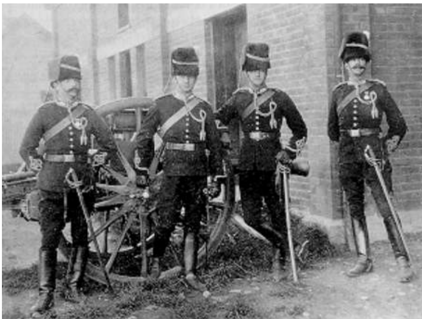
Officers of 31(B)Bty at about the same time

For many years after the noon time gun was fired by a member of D Battery each day, until the practice finally petered out shortly before the turn of the century.