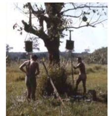
The Shower blocks at Bien Hoa and at Baria