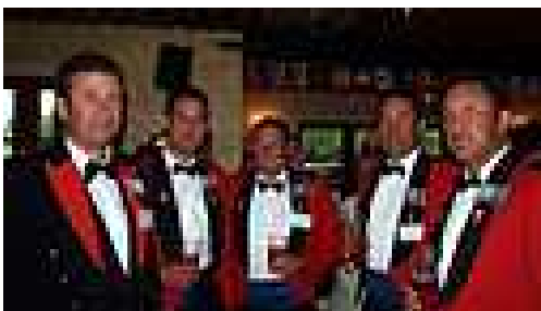
A group of “current gunners”