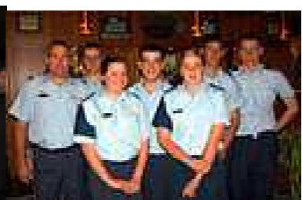
The happy and willing Cadets from No 17 Squadron, City of Christchurch