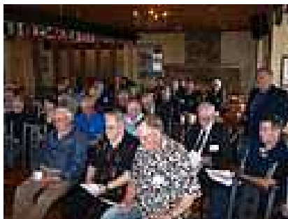
Attendees at the RNZA Assn AGM