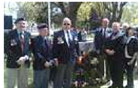
Our “ Aussie Mates” at the Remembrance Day Service