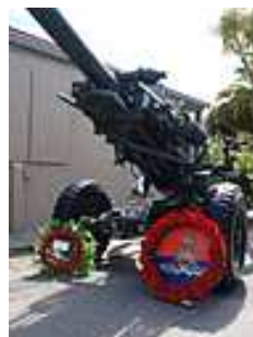
Wreaths that had been laid at the Commemorative Service