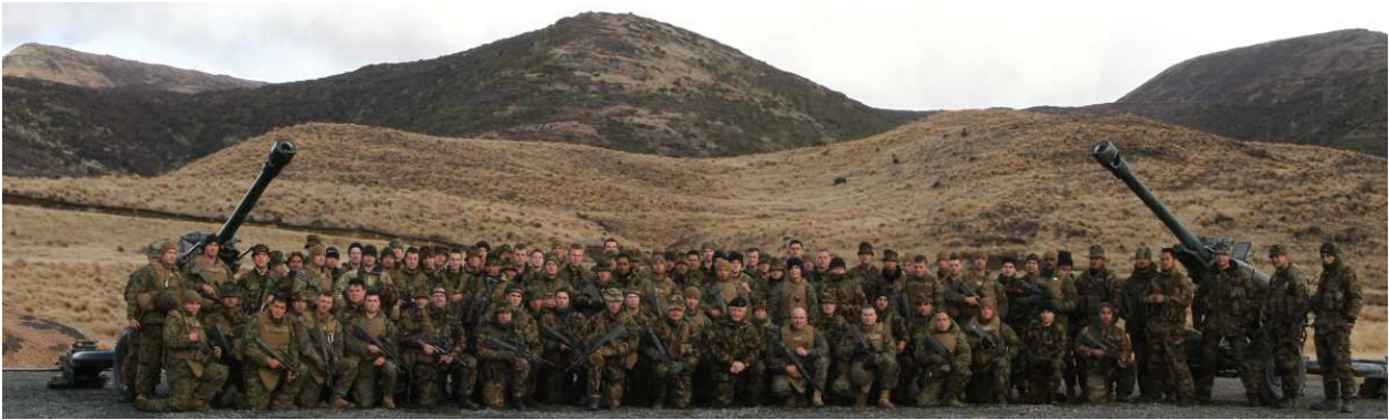
The photo is from Exercise Brimstone held in Waiouru from 18th - 27th June 2012, members of 161 and 163 Battery with Alpha Battery, 1st Battalion, 11th Marines at "Fingers" in Waiouru.