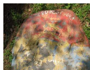
4 Fd Regt