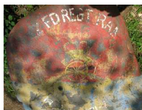
12 Fd Regt