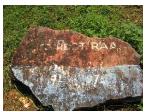
1st Fd Regt